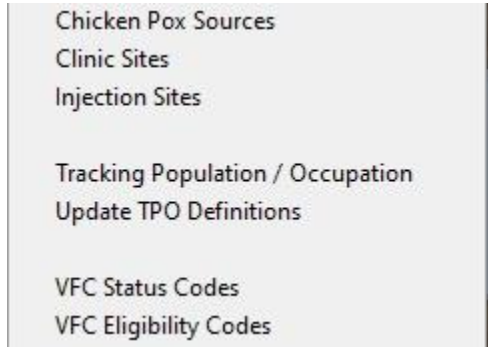
Target Population / Occupation menu selection

The list of TPO selections for the Population / Occupation specification can be accessed with the Tracking Population / Occupation menu option of the Health Services Vaccination Details Maintenance menu. The section of the Maintenance menu with such menu option is shown below.