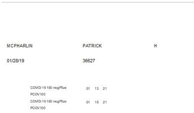
Output for Printing Proof of Vaccination

The output of the Covid Proof of Vaccination will provide the details to fill in the boxes on the Proof of Vaccination card. An example showing the output of the printing is shown below: